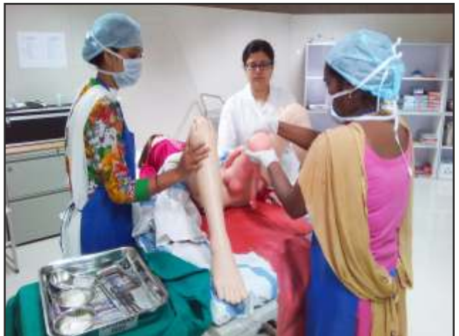
Obstetrical & Gynecological Nursing Lab