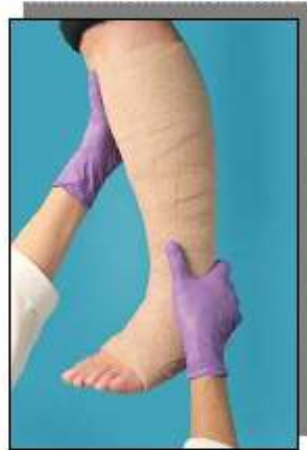
Coban™ 2 Layer Compression System