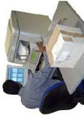
Healthcare Document Management Systems