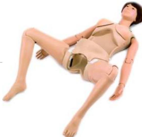
* Full Body Pregnancy Simulator