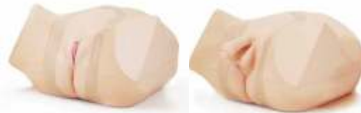
* Male / Female Catheterization Simulator