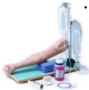
* Multipurpose Injection Training Arm