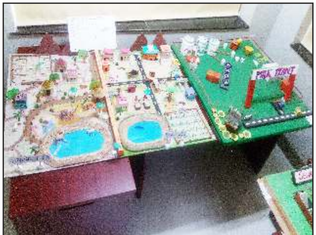
Activities by students