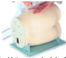
* Gluteal Intramuscular Injection Model