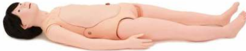
* Patient Care Simulator