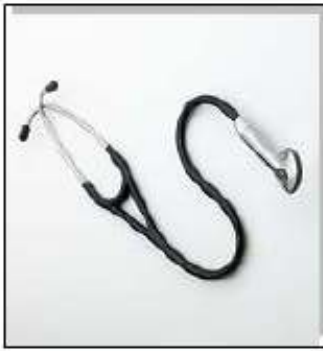
Littmann™ Electronic Stethoscopes