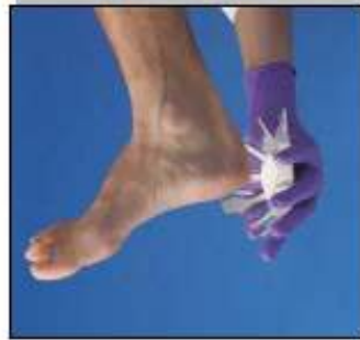
Advanced Chronic Wound Dressing