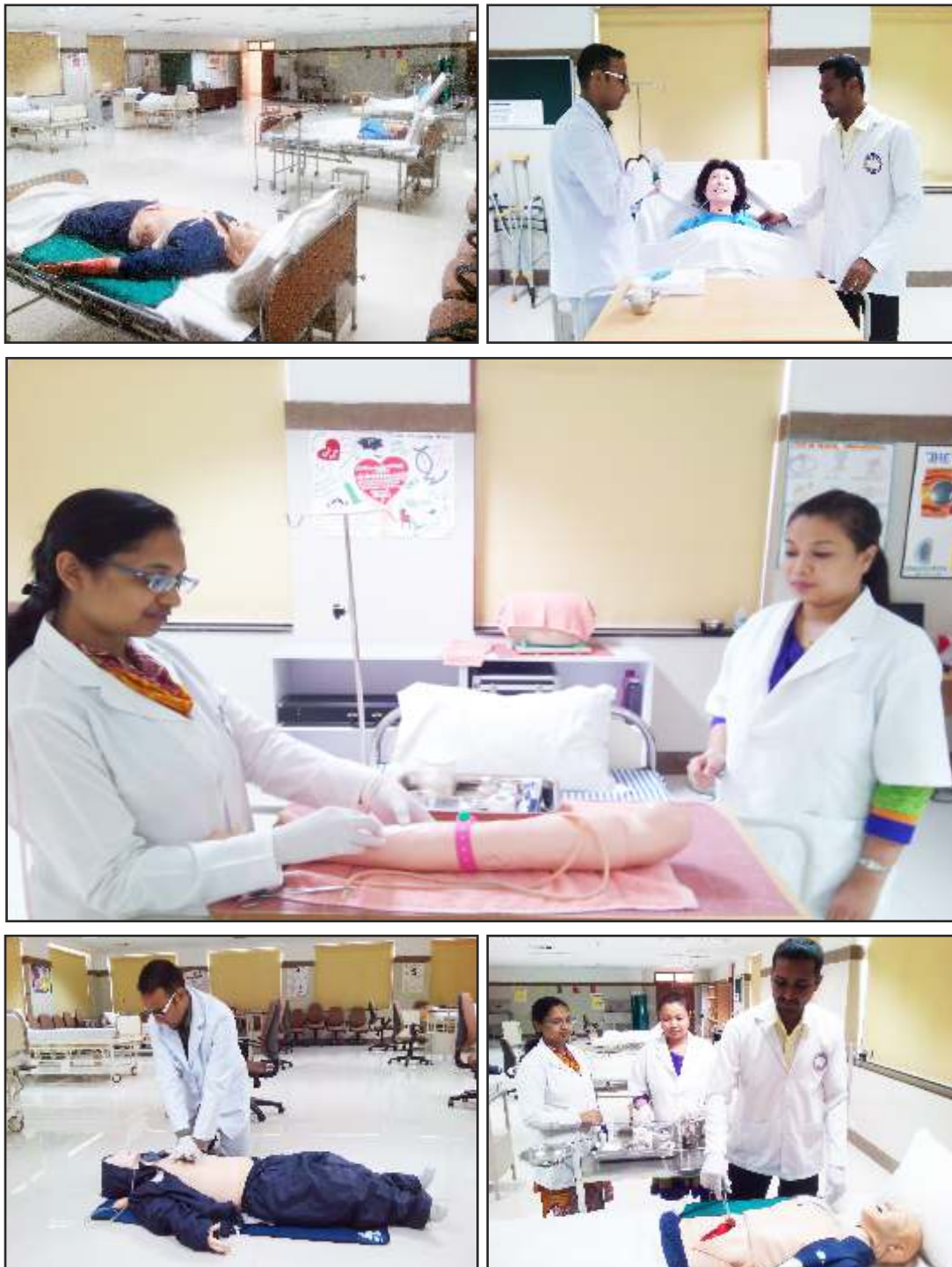
Nursing Foundation Skill Lab