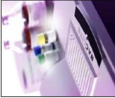
BacLite™ Rapid MRSA Test