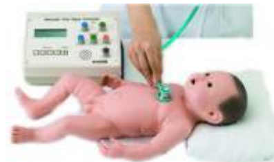
* Neonatal Vital Signs Simulator