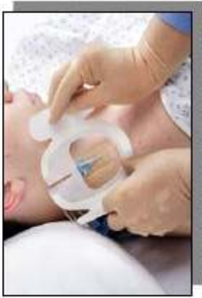
Advanced Tegaderm™ CHG Dressing